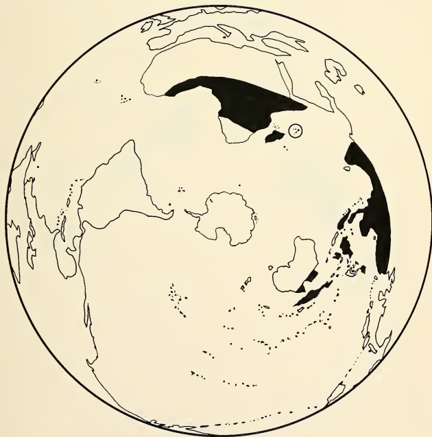
Fig. 7. Distribution of the living members of the family Ranidae (except Rana ).

Microhylidae . This family is found in Africa south of the Sahara, Madagascar, southern Asia and the East Indies to New Guinea and the northern tip of Australia, and in South America. One genus ranges north to central United States and one Asian group north to Manchuria. There are about forty genera and many species. Figure 8 shows the distribution of the Microhylidae .